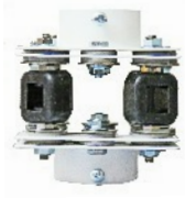
NB-UIM-15 to NB-UIM-60 Measure 4" x 4"