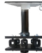
Ceiling Plate Comes with NB-UIM-W-96 & with NB-UIM-96 & Safety Cable