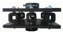
Exploded view of the NB-UIM-96-US attached to Unistrut