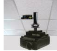
The NB-UIM Anti-Vibration Adaptor shown installed 3" above a projector's Mount.

All Ship completely assembled for instant attachment to the Projector's 1 1/2" Dia Pole