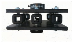
NB-UIM-96 Measures 6½ x 6½

All our Anti-Vibration Devices use a proprietary Visco-Elastic Polymer that flows like a liquid under load. Combining this fast reacting high energy absorption with a near faultless long Memory, guarantees it will outlast any other material, including all one dimensional materials like Rubber or Springs that are often used in an attempt to cure vibration. Rubber in particular has a short life and Springs will also lose their efficiency over a similar short time.