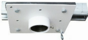
Ceiling Plate attached to Unistrut